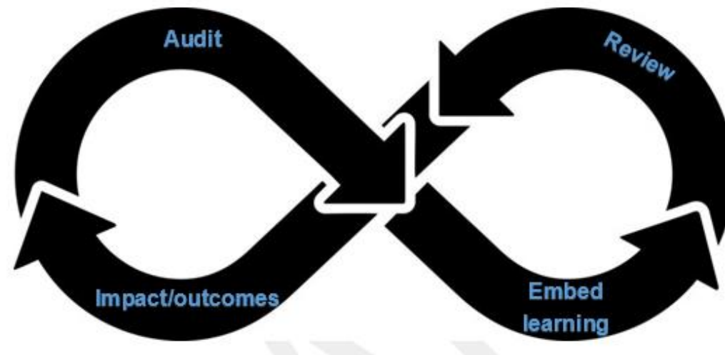
Figure 2: Continuous Learning & Improvement Cycle

Blackpool Partnership Boards Quality & Learning Improvement Framework (QALIF) sets out the methods our partnership will undertake, to quality assure safeguarding practice undertaken by individual agencies and as a partnership. The QALIF provides details related to each of the elements of quality assurance displayed in the diagram below. The diagram also illustrates how this quality assurance learning will be shared with our partnership, so can be implemented by Blackpool's Workforce Development Offer .